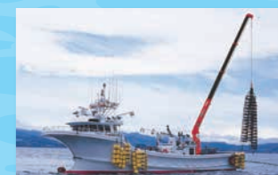
Ocean cranes These machines are used in oyster farming and unloading catches from vessels.