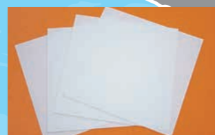
AlN ceramics These materials are used to counter the extra heat produced by higher-performance electronic equipment.