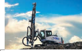
Hydraulic crawler drills These machines drill holes for blasting at stone-crushing plants and limestone mines.