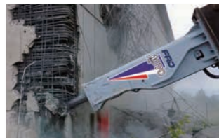
Hydraulic breakers These machines are used to break rocks and crush concrete.