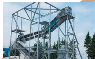
Enclosed suspended conveyors These conveyors are used to close off and vertically transport materials.