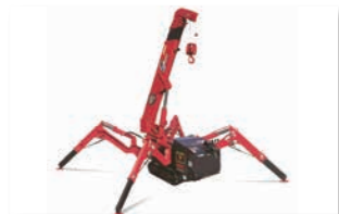
Mini crawler cranes Outside Japan, these cranes are used on construction sites for skyscrapers and the like.

A closer look at everyday life reveals the Furukawa Group's products and technologies in action in readily recognizable places. The Group's products and technologies touch every aspect of our lives, making them convenient and prosperous, and protecting the safety and security of society.