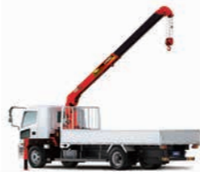
UNIC cranes These truck-mounted cranes are used on construction sites and the like.