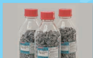
High-purity arsenic This high-purity metal is used as a raw material for mobile equipment and lasers.