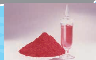
Cuprous oxide This eco-friendly substance is used to coat the undersides of marine vessels.