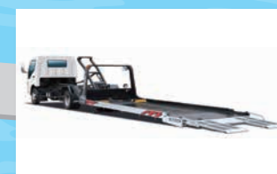
UNIC carriers Trucks that carry new cars and damaged cars.