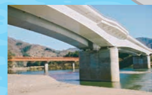
Bridges and steel structures We construct pedestrian bridges, motorways, and more.