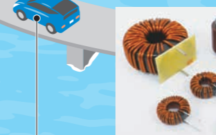
Coils Filter coils are used to control noise from electric control units and power sources.