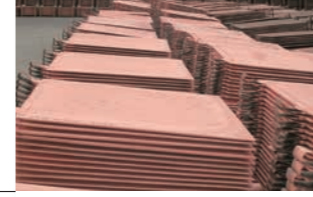
Electrolytic copper This substance is used in the wires, copper pipes, and other components of household appliances, communication devices, and automobiles.