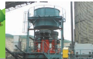
Crushers These machines crush rocks into smaller pieces at quarry.