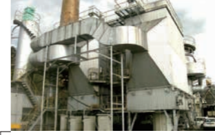
Electrostatic precipitators This equipment prevents air pollution from plants and other facilities.