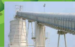
Belt conveyors This equipment transports massive amounts of earth and sand, ore, coal, and other raw materials.