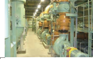
Pumping equipment at wastewater treatment facilities We have a wealth of experience with this equipment at wastewater treatment plants and water treatment plants throughout Japan.